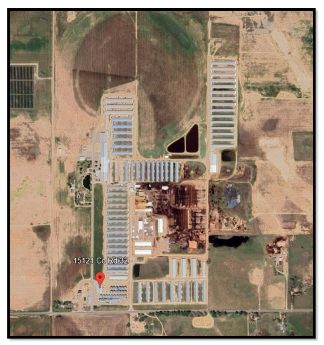
Image of the over all facility obtained from Google Earth. Note view is with North toward the top.