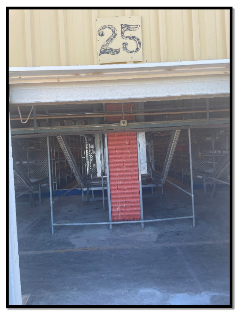
IMG_1393 showing the entrance to barn 25 on the west side of the building.