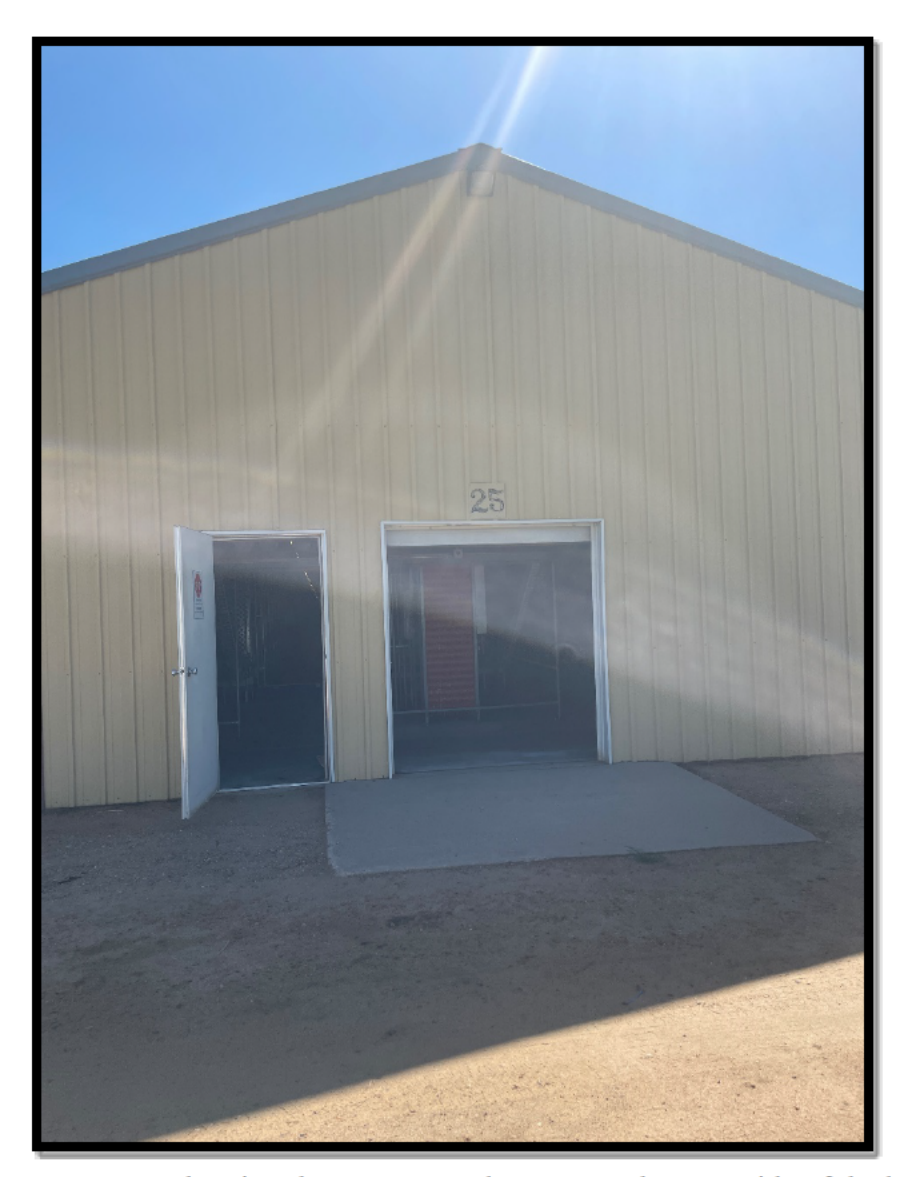
IMG_1397 showing the entrance to barn 25 on the west side of the building.