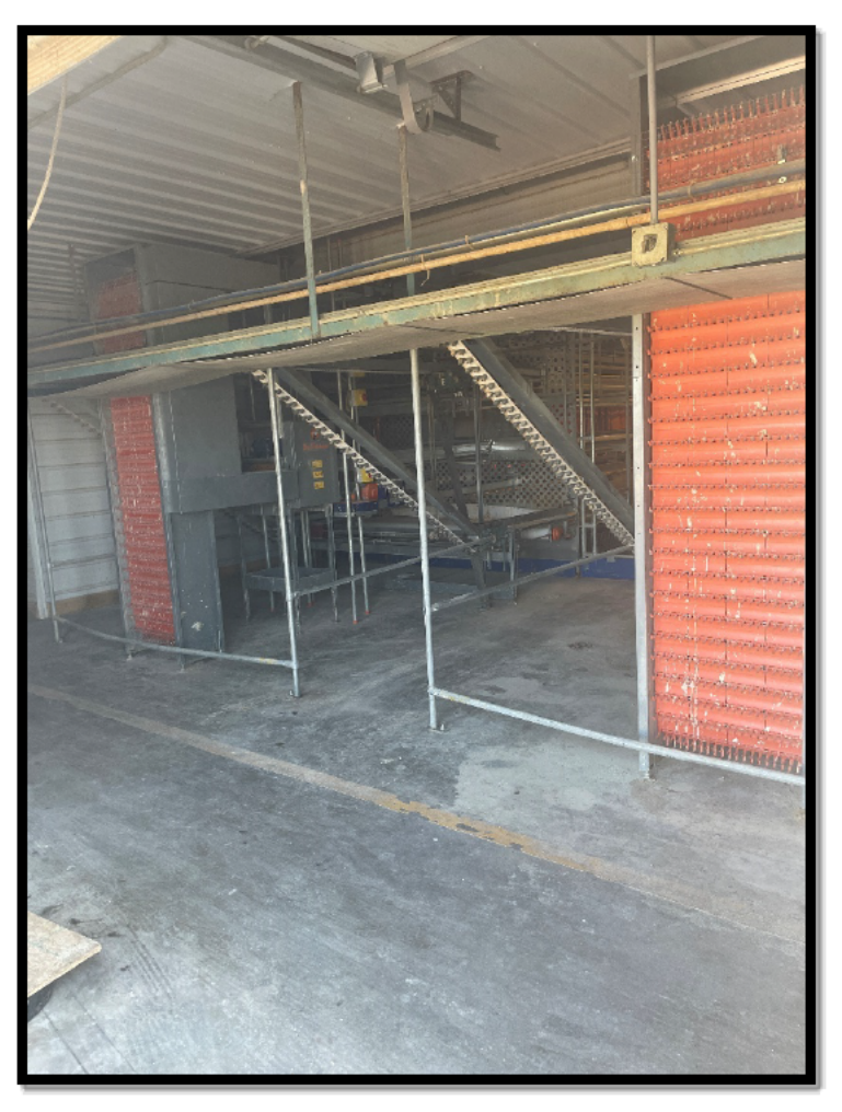
Img_1395 showing the condition of the inside of barn 25 from the west side enteance.