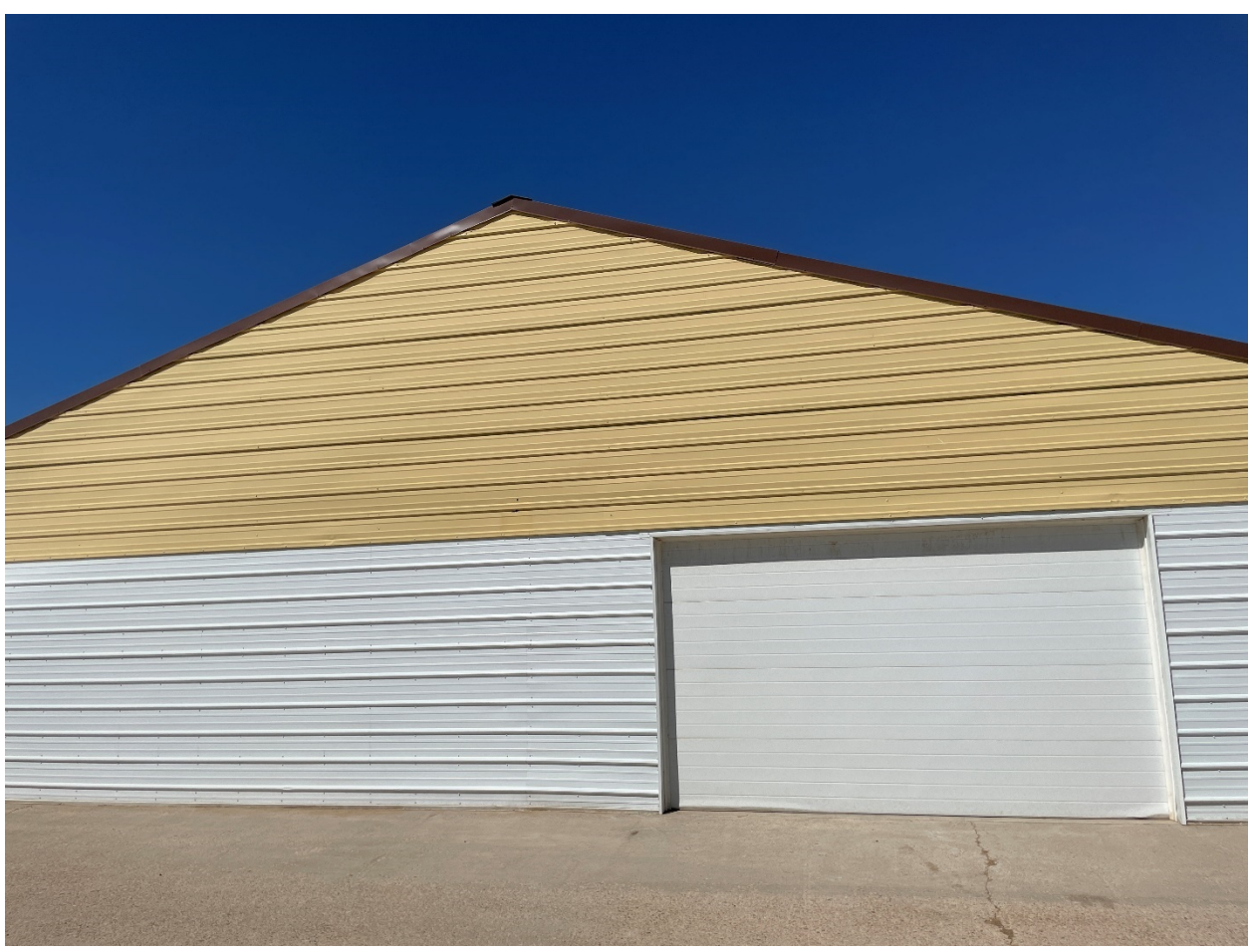
Img_1405 showing the enterance of barn 25 from the east side.