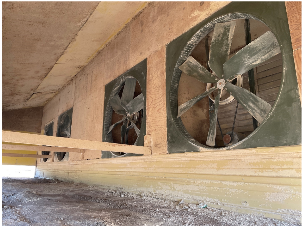
IMG_1403 showing the ventilation fans for barn 25 on the north side of the building. (Note there are not ventilation fans on the south side of the building).