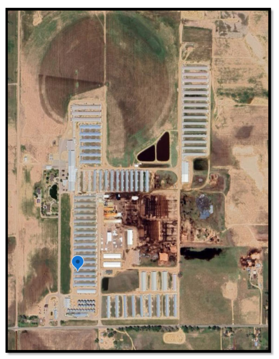
Screen shot of Goole Earth image showing the approximate location of Barn 25, denoted with blue pin.