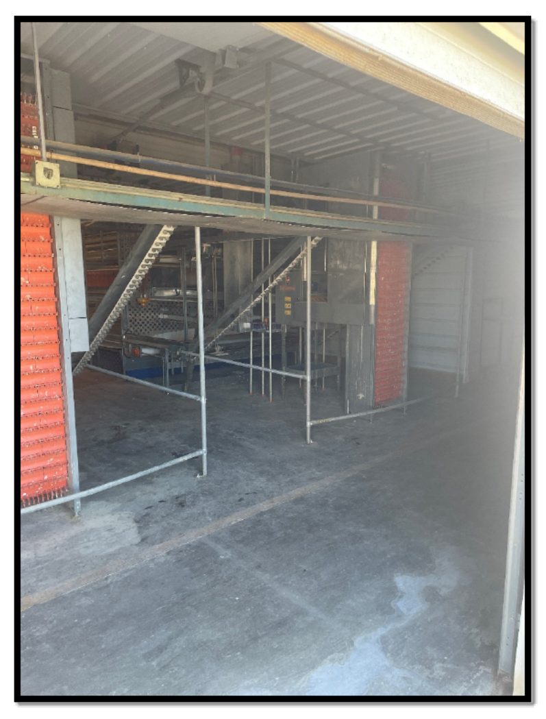
Img_1394 showing the condition of the inside of barn 25 from the west side enteance.