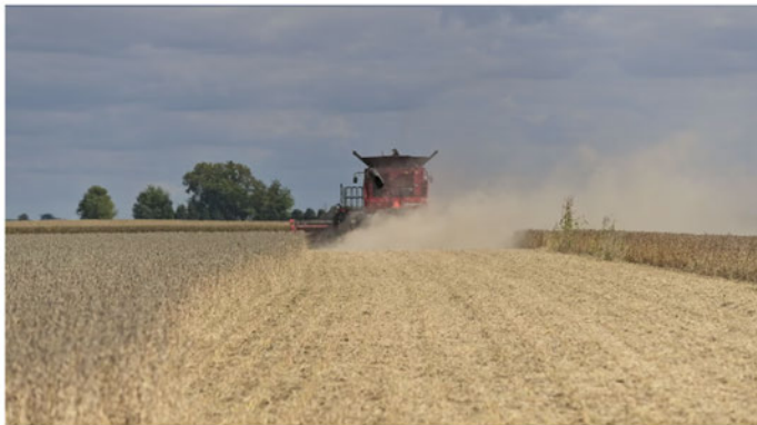
📷 A combine harvester powers through a soybean field in McLean county, Illinois, on 25 September.

Sentient Media reveals less than 4% of climate news stories mention animal agriculture as source of carbon emissions